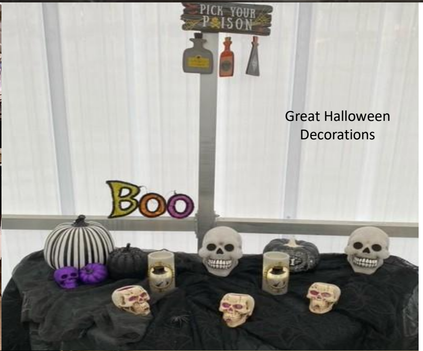
Great Halloween Decorations