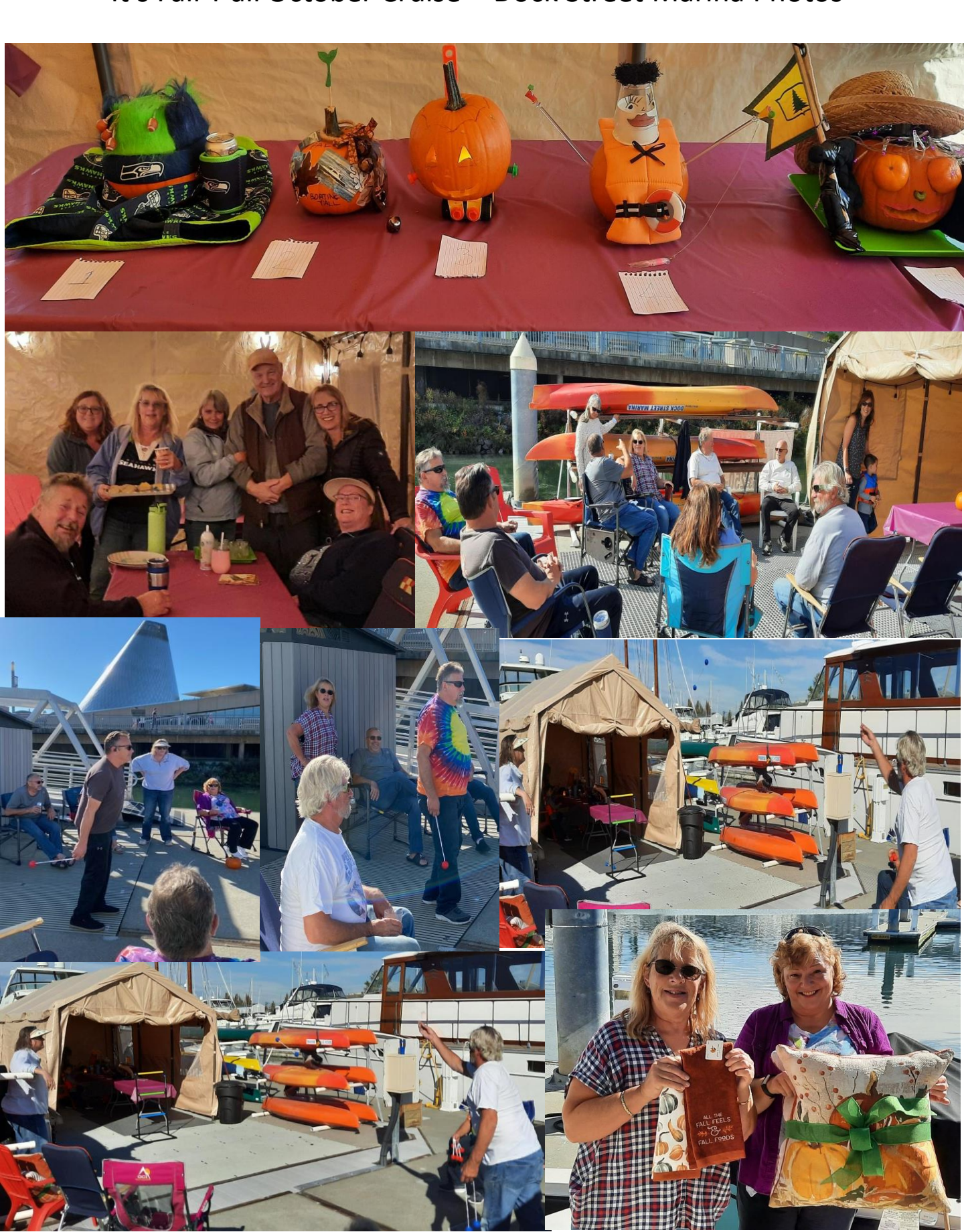
It's Fall Y'all October Cruise – Dock Street Marina Photos